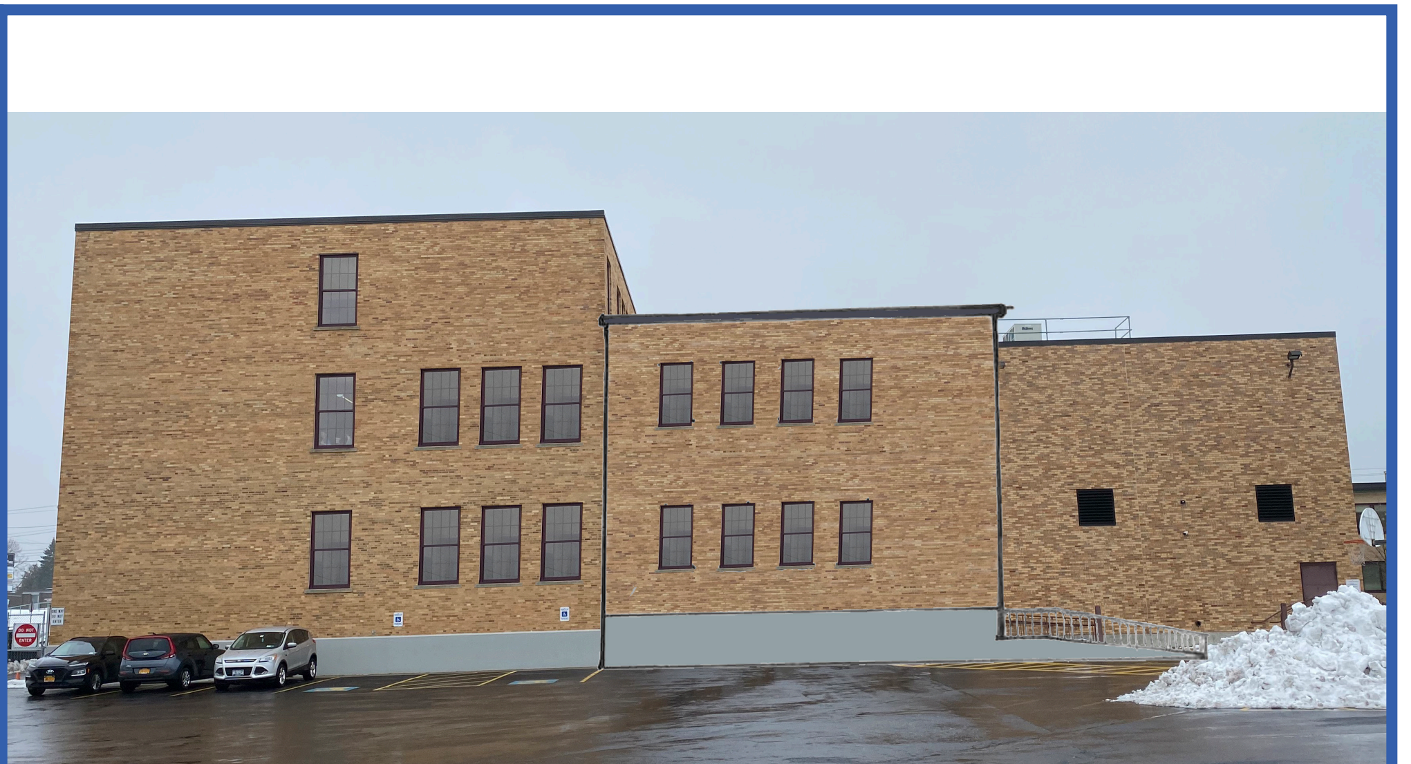
Building Elevation with Proposed Addition