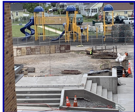
Start of new outdoor classroom with amphitheater type seating for classroom instructional use and/or passive recreation.

Start of the facilities planned capital improvement project of repurposing two existing classrooms into a fitness and wellness room. This fitness/wellness room will contain cardio equipment, yoga mat space, and strengthening and exercise equipment. Given our limited outdoor area, this will enhance our offerings in Physical Education class instruction. The space will also provide a quiet stress release area for students working with counselors and the school psychologist. This fitness center will also be for community use.